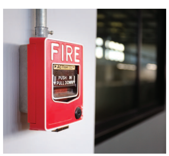
Fire detection and alarm systems