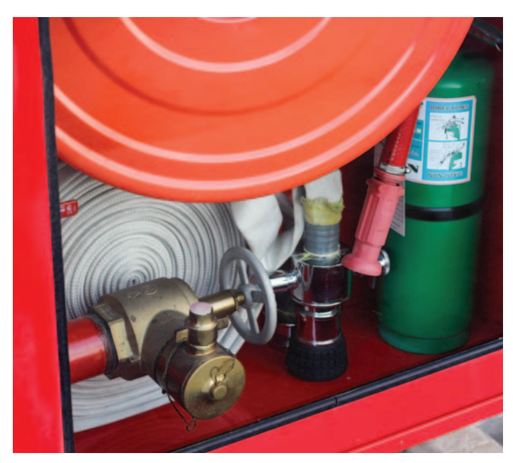
Fire hoses, couplings and accessories