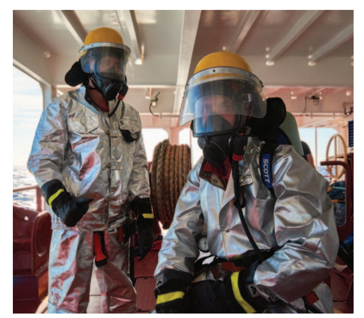
Protection suits (fire and chemicals)