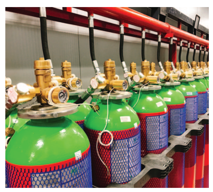
Fire suppression systems

Star International operates to the highest of industry standards and holds both ISO 9001 Quality Management and ISO 45001 Occupational Health and Safety.