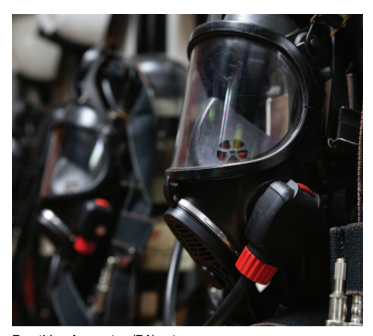
Breathing Apparatus (BA) sets