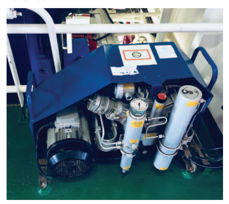
Breathing Air (BA) compressors

The team operates from three bases in the UK, located in Birkenhead, Southampton, Glasgow and Truro. Our capabilities allow a fast response service across the UK and Europe, with the ability to deliver scheduled work worldwide.