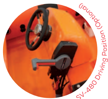
(optional) SV-480 Driving Position

Fully compliant with all SOLAS requirements. The ideal choice for search and rescue teams, coast guards, surveillance, and other marine professionals who demand the best in reliability and performance.