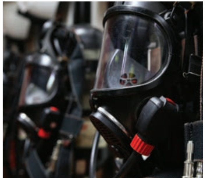
Breathing Apparatus (BA) sets