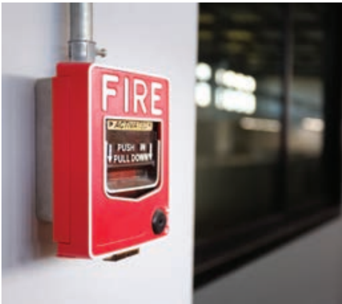
Fire detection and alarm systems