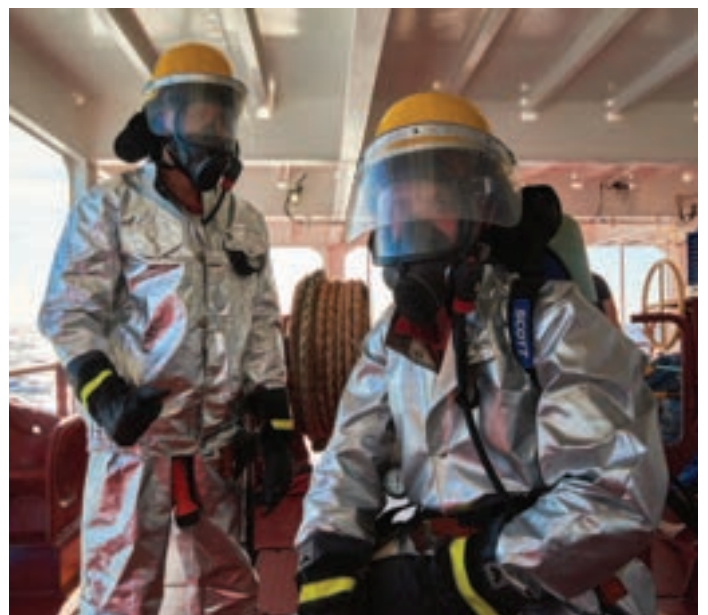
Protection suits (fire and chemicals)