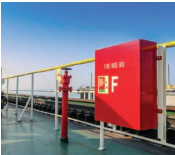
Fire lockers, cabinets and equipment