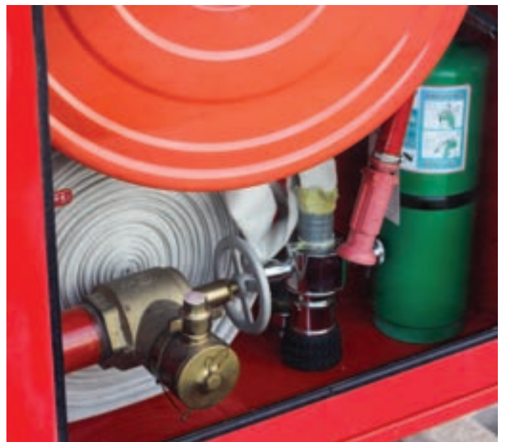
Fire hoses, couplings and accessories