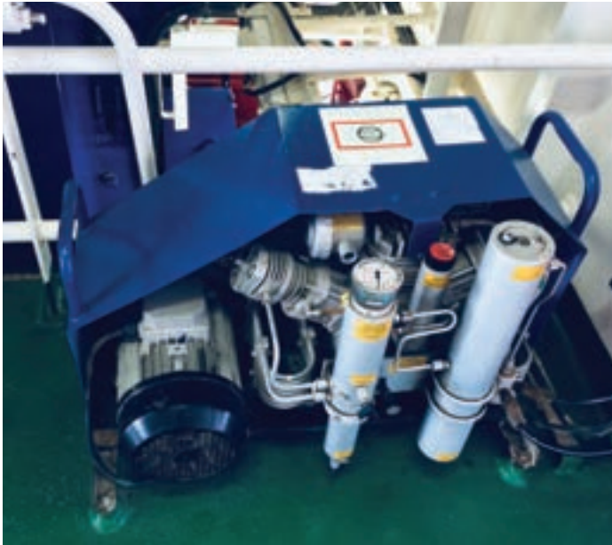
Breathing Air (BA) compressors

The team operates from three bases in the UK, located in Birkenhead, Southampton, Glasgow and Truro. Our capabilities allow a fast response service across the UK and Europe, with the ability to deliver scheduled work worldwide.