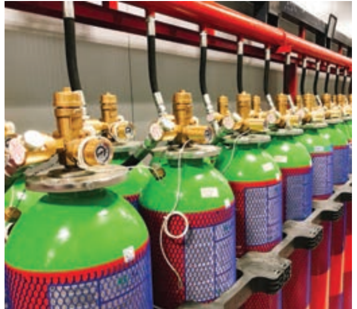
Fire suppression systems